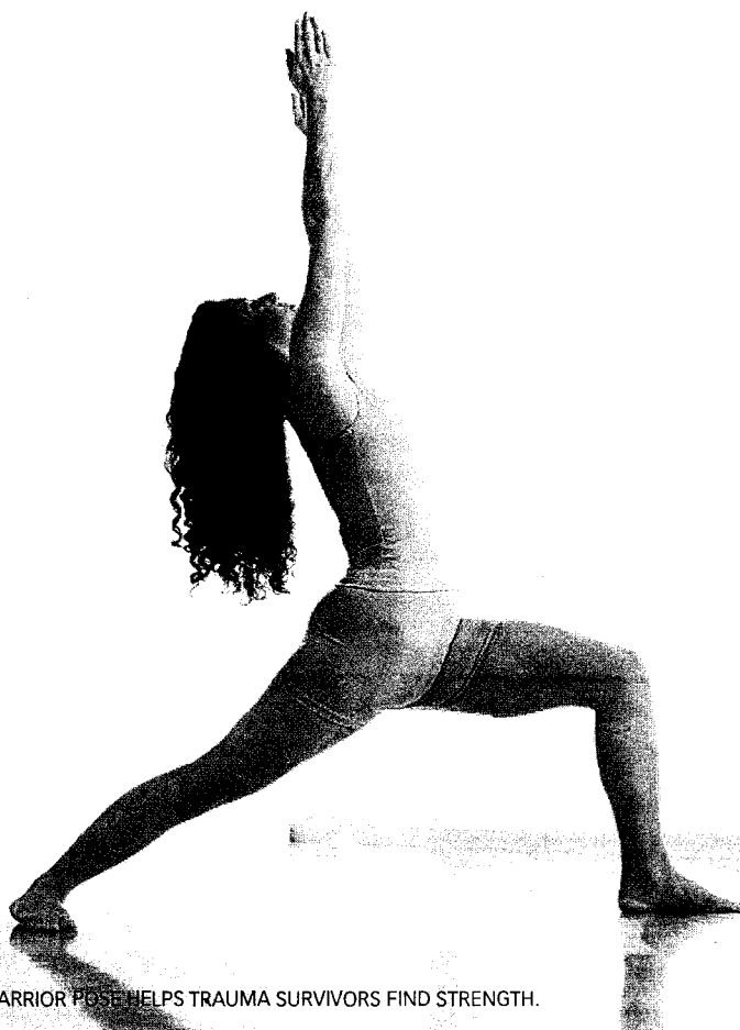
WARRIOR POSE HELPS TRAUMA SURVIVORS FIND STRENGTH.

This painful reliving of events is a common symptom of PTSD, a chronic anxiety disorder that can develop after someone is involved in a traumatic event, whether it's a sexual or physical assault, a war, a natural disaster, or even a car accident. Existing treatments—which include group and individual therapy and drugs such as Prozac—work only for some patients.